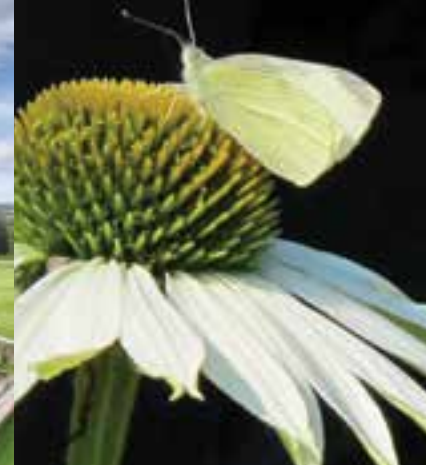
Boyne Garden Centre, Slane Co. Meath

Open: Mar-Sept, Mon-Sat, 10am-6pm, Sun 12.00-5.30pm. Oct-Feb, Weds-Sat, 10am-5pm. Child friendly. Bus parking. Dogs on leads.