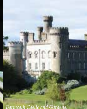
Barmeath Castle and Gardens, Dunleer, Co. Louth