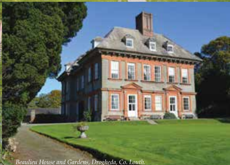
Beaulieu House and Gardens, Drogheda, Co. Louth.