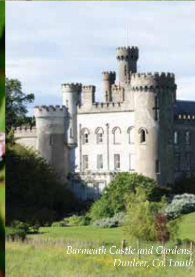
Barmeath Castle and Gardens, Dunleer, Co. Louth