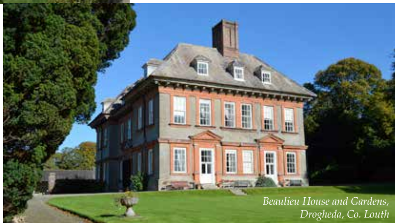
Beaulieu House and Gardens, Drogheda, Co. Louth