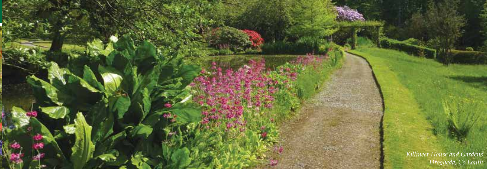
Killineer House and Gardens Drogheda, Co Louth